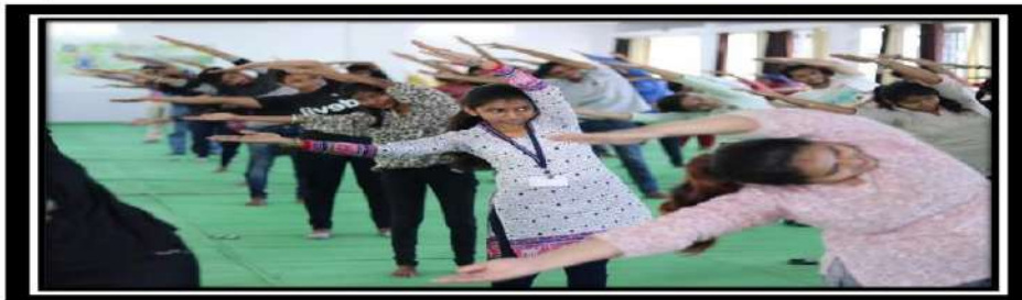
Yoga @A.P.S.G.M.N.S.GOV.T. P.G.COLLEGE KAWARDHA