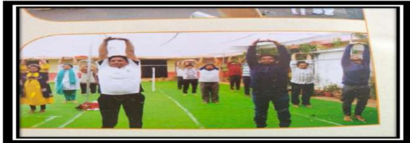
Yoga @A.P.S.G.M.N.S.GOV.T. P.G.COLLEGE KAWARDHA